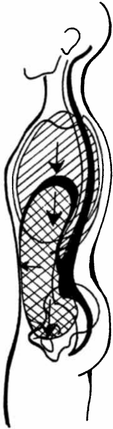
fig. 1 —A schematic representation of the side view of the human trunk. The lined area represents the thoracic cavity, the crosshatched area the abdominal cavity, and the black area between the two cavities represents the diaphragm in a released (uncontracted) position. The arrows indicate that as the diaphragm contracts on an inhalation, the thoracic cavity floor will move down, causing the roof of the abdominal cavity to be lowered so that the abdominal contents will press outward toward the front of the trunk and downward into the pelvis.

the base of the neck to a few inches above the navel. Essentially, it is a sealed-off container for the lungs, with the heart resting in between. The abdominal cavity consists of the part of the trunk that begins at the lower border of the rib cage and fills the space down into the pelvis. This sack contains the digestive organs. The two cavities are separated by a thin strong muscle called the diaphragm. It attaches all around the lower border of the rib cage and ties down to the lower spine in back. It is like a hemisphere that arches up into the thoracic cavity forming both the roof of the abdominal cavity and the floor of the thoracic cavity.